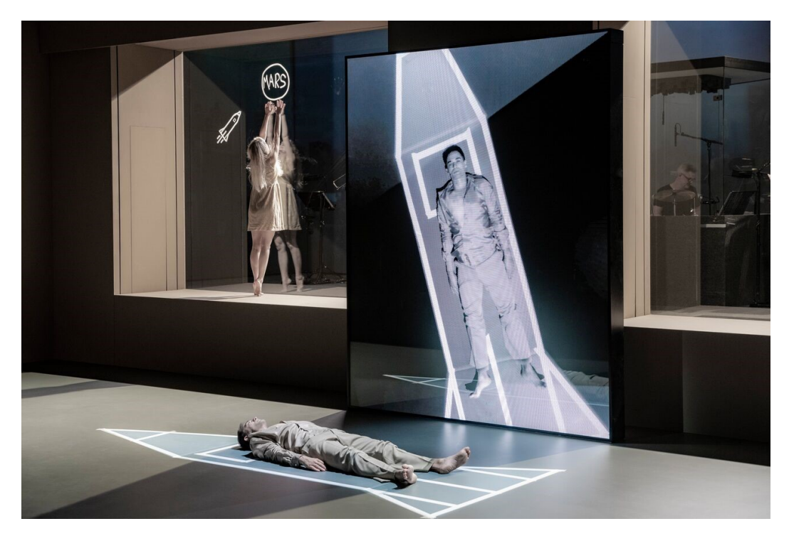
Scene from Lazarus, the award-winning musical by David Bowie and Enda Walsh

Sennheiser Digital 6000 delivers no-compromise RF reliability, ease of use, and ultimate sound clarity for Lazarus